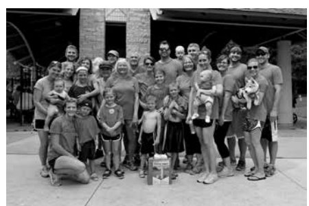
THIRD PLACE Team Charlie