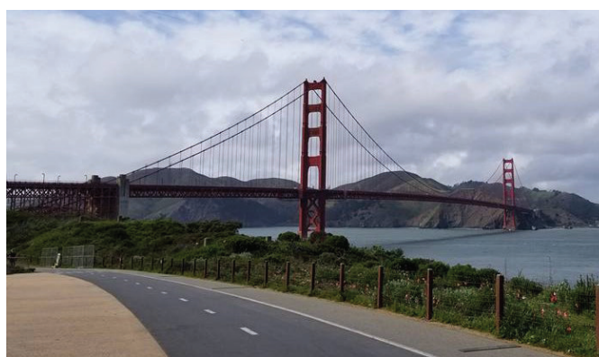
Painted Ladies, top right. Golden Gate Bridge, center. Trolley, right top.